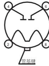
电极与引线连接图